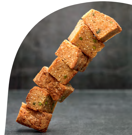
Photo credit: Recipe taken from Tom's Table by Tom Kerridge (Bloomsbury, £25) Photography © Cristian Barnett