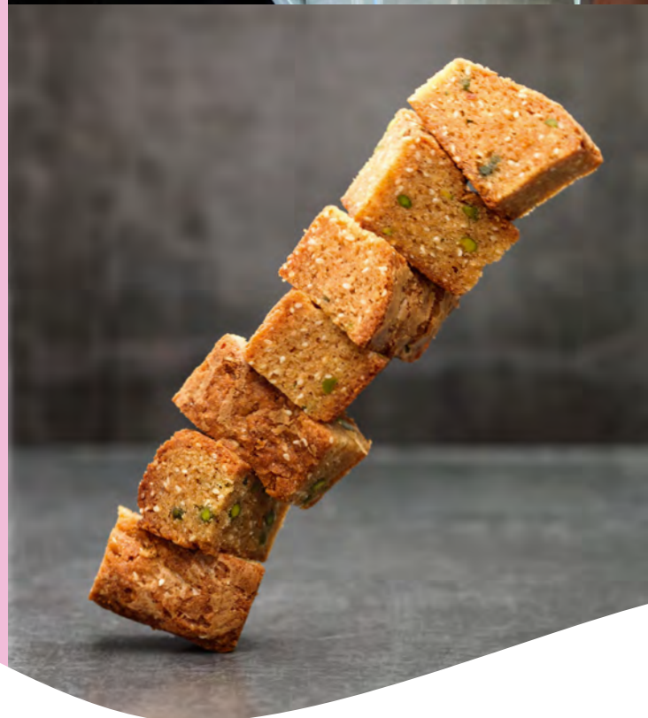
Photo credit: Recipe taken from Tom's Table by Tom Kerridge (Bloomsbury, £25) Photography © Cristian Barnett.