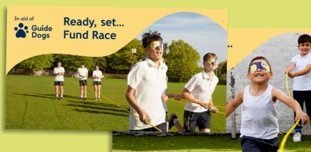
Assembly PowerPoint presentations