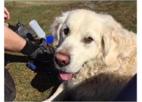
Bailey aged 8 months